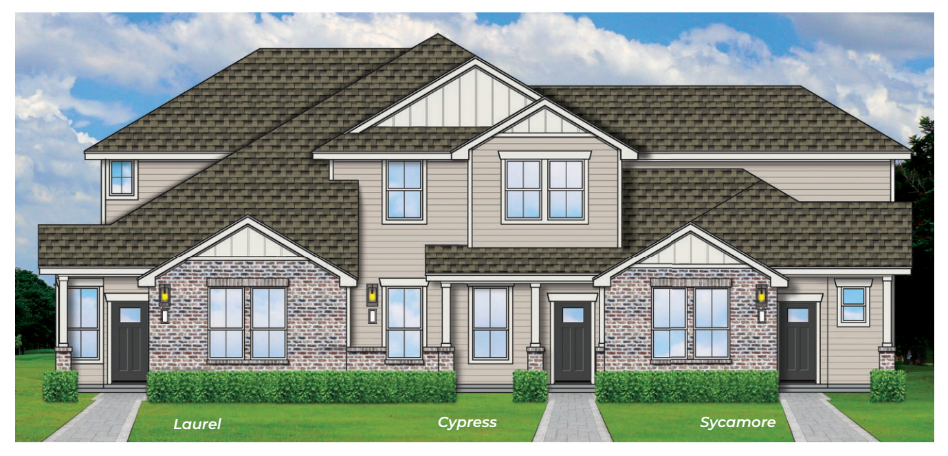
Elevation A - Scheme 3

1503 sq.ft. · 3 Bedroom · 2.5 Bathrooms · 2 Story