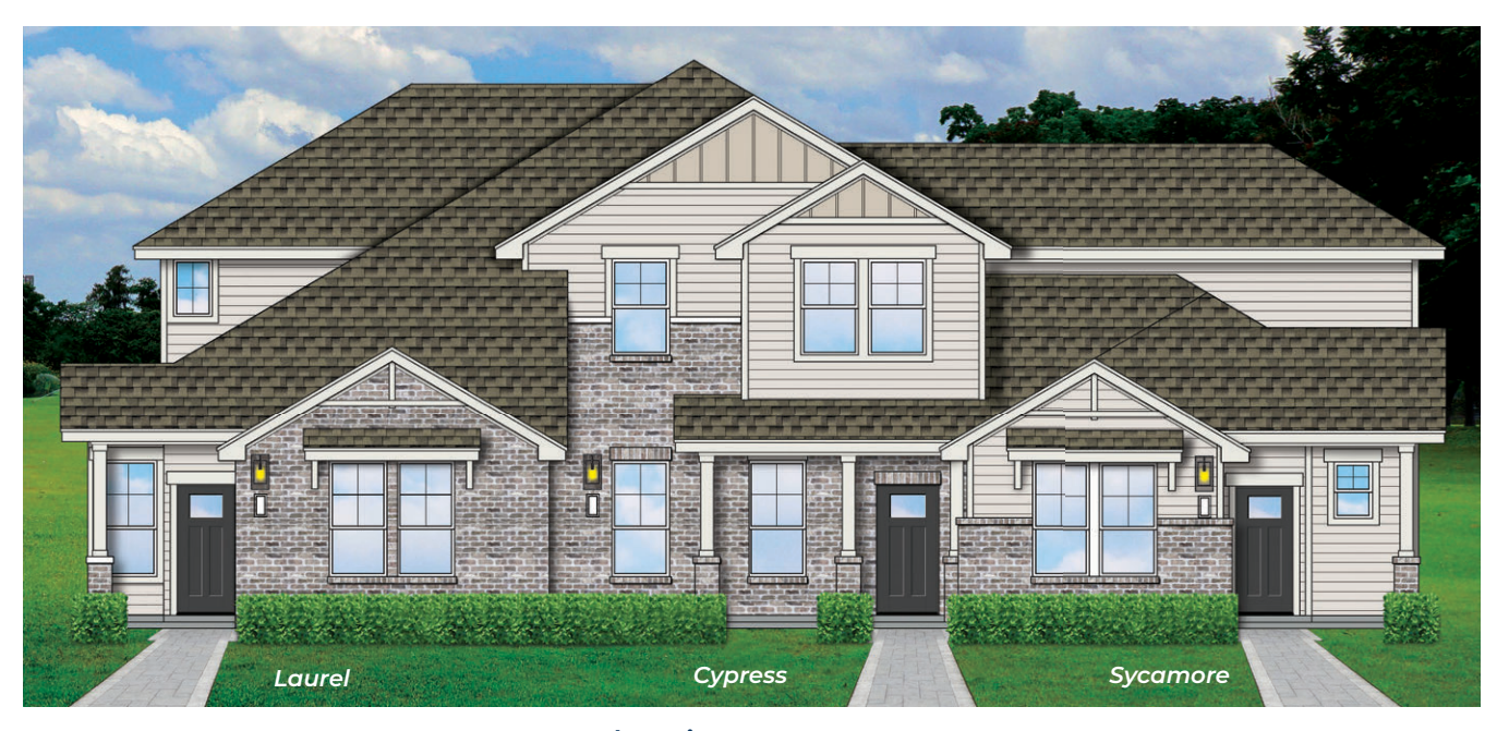
Elevation B - Scheme 4